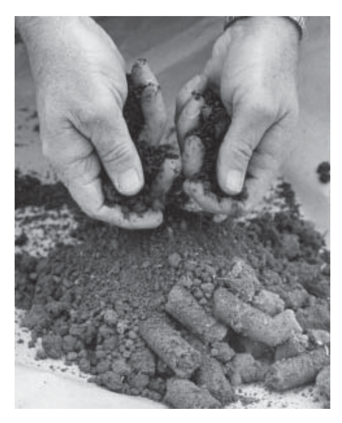
Figure 4. Break up clods while a sample is moist, and spread out to air dry in a clean area.

After all cores for an individual sample are collected and placed in the bucket, crush the soil material and mix the sample thoroughly (Figure 4). Allow the sample to air dry in an open space free from contamination. Do not dry the sample in an oven or at an abnormally high temperature. When dry, fill the sample container with the soil (Figure 5).