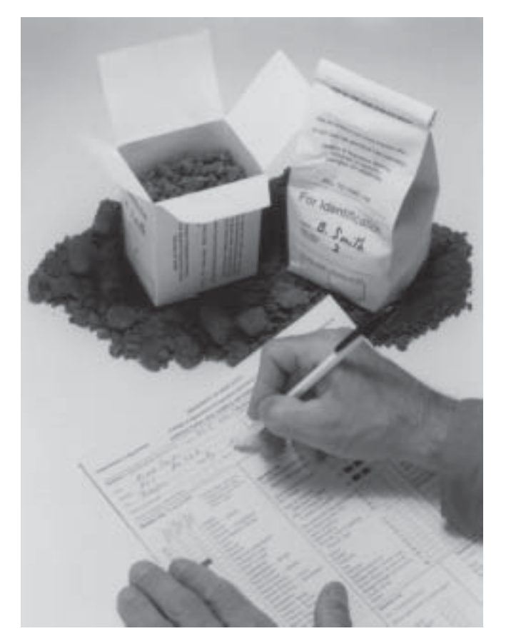
Figure 5. Thoroughly mix the air-dried sample, fill the sample bag or box, mark with your sample designation, fill out the information sheet, and take the sample to your county Extension office.