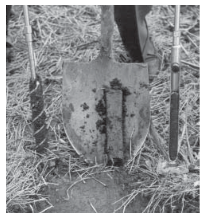
Figure 1. A soil probe, auger, or spade and knife should be used in sampling soils. The spade sample must be trimmed as shown.

agement practices (Figure 2). For example, a portion of a field may have a history of manure application or tobacco production while the other part does not. Phosphorus and potassium levels will likely be higher in these areas, causing the rest of the field to be under-fertilized if the field is sampled as one